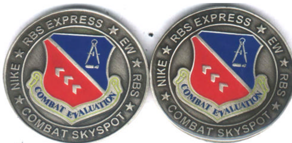
FIGURE 2: TWO VERSIONS OF NEW COIN FRONT SIDE

The original coin (Fig 1) had a clear coat finish on the back, which feels smooth to touch. The front side has the clear coat finish on the emblem only.