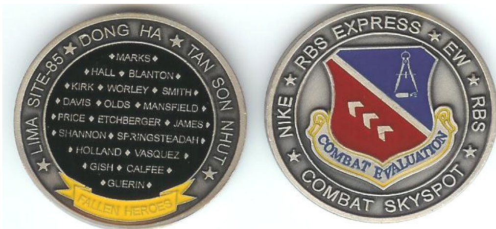
FIGURE 1: THE ORIGINAL COIN

The sample coins have arrived. There are some differences from the original coin. You might remember the original vendor went out of business. Please examine the pictures and give me your opinion. The pictures might not be of sufficient clarity to discern the differences.